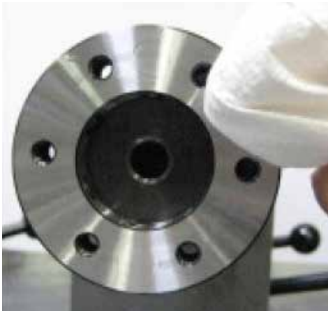
FIG. 1: Holder module