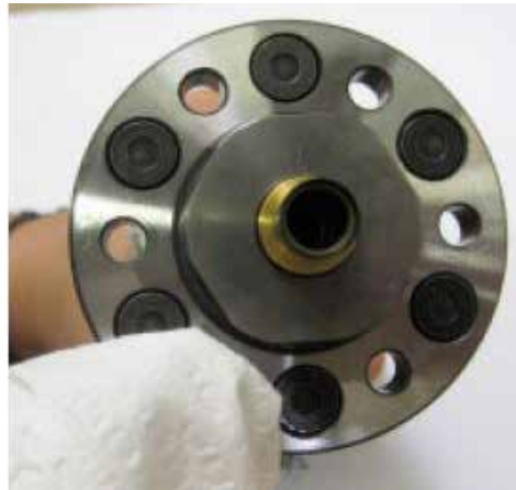
FIG. 2: Holder adapter